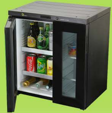
DD46 Top Dry Section