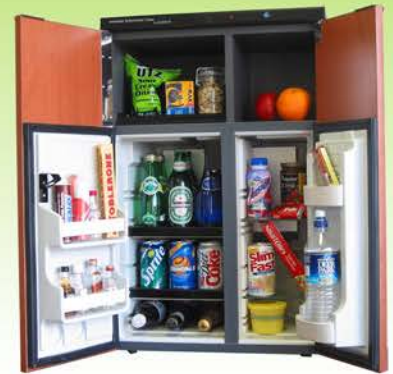
DD46 Opaque Doors