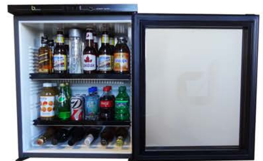
CH46 without Balconies and Clear Glass Door

3 balcony (optional) Integrated Dry Sections External Sections for Dry Products