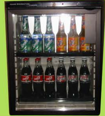
CH46 Black Frame Blue Logo Glass Door