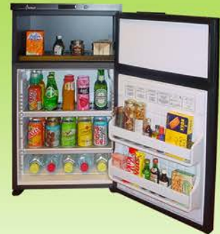
C41 Opaque White Glass Door