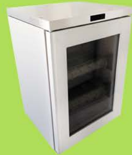
C41 Top Dry Section