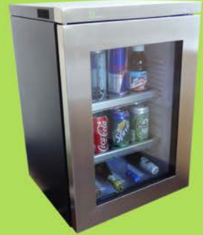
C32 White Frame Glass Door