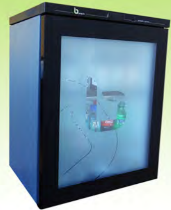
CH46 without Balconies and Clear Glass Door