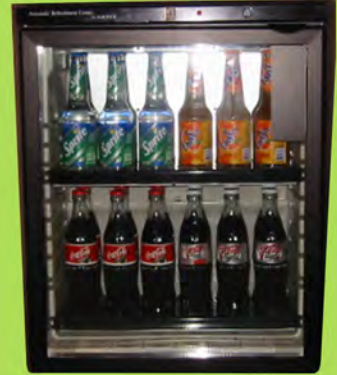
CH46 Black Frame Blue Logo Glass Door