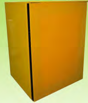
CH41 No-Top Version