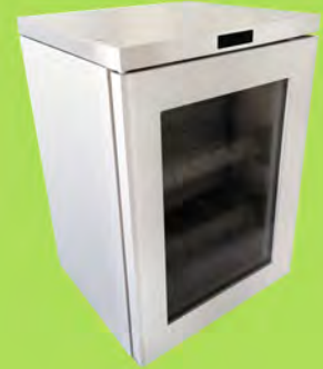
CH41 No-Top Version