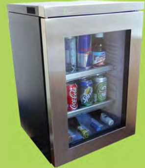
CH32 White Frame Glass Door