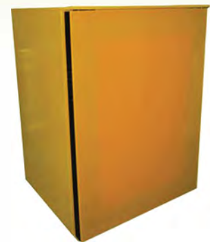
CH32 Opaque Black Glass Door