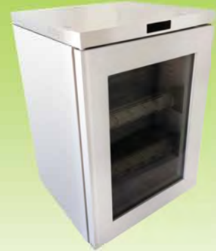
CH32 No-Top Version