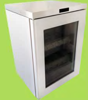
C46 Black Frame Clear Glass Door